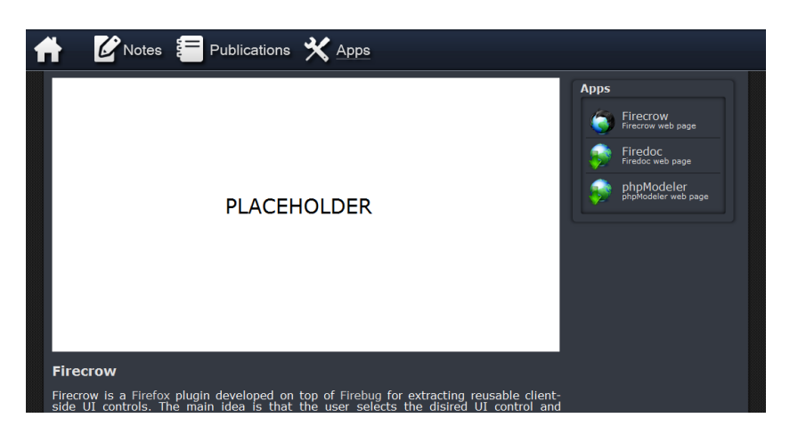
Fig. 4: The host web page with a placeholder for the extracted control