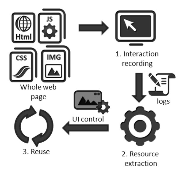
Fig. 1: Extracting and reusing UI controls in Web applications

The process can be separated into three phases: 1) Interaction recording, 2) Resource extraction, and 3) UI control reuse (Figure 1).