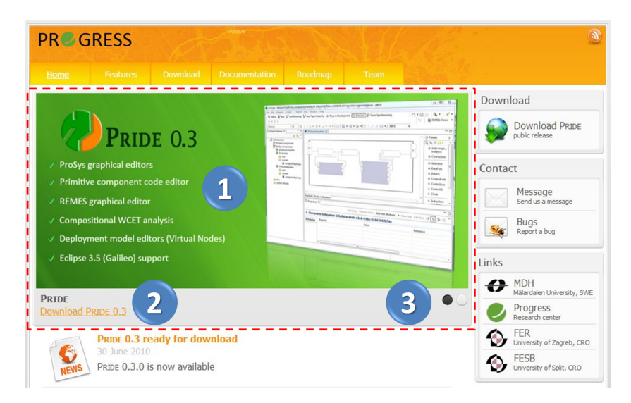
Fig. 2: The web page of the UI control chosen for extraction

The purpose of the interaction recording phase is to locate all code and resources necessary for stand-alone functioning of the target UI control. In order to do that, the user has to first select the chosen control. However, the control does not exist as a separate entity in the web page. So, in our approach the control is selected through the corresponding HTML node defining the UI control. This is done with Firebug's DOM (Document Object Model) explorer in which the user can go through the DOM of the page.