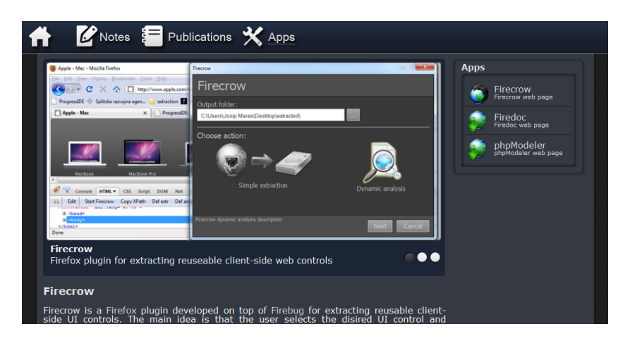
Fig. 6: The result of adapting the extracted UI control

building source models, extracting code, downloading resources, merging code and resources are functionalities that are all encapsulated in a Java library that can be called from any browser on any operating system. The whole source of the program can be downloaded from http://www.fesb.hr/~jomaras/?id=Firecrow.