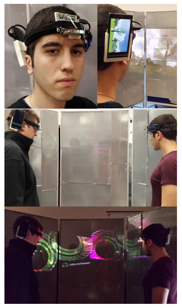
Figure 2. The top picture shows two different photographs of a user with our wearable augmented reality display, the system is composed of a smartphone, an external battery and a pico projector with 3D printed housings. The two photographs(middle and bottom) are showing a scenario where multiple users independently taking benefit of a passive retro-reflective screen without crosstalk.