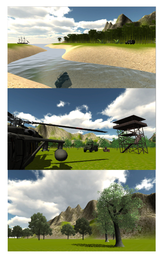
Figure 5. Screen-shots from the different locations in the digital environment.

In Figure 5, the three locations that were implemented for testing and exploring our digital environment are depicted. To create the digital environment, a height map of an island was taken and modified to get the basic layout of the digital environment. Used content and textures to create the environment are freely accessible on the Internet or through the Unity Asset Store.