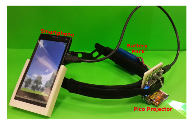
Figure 3. A photograph of the hardware device, equipped with a smartphone, a battery and a pico projector. The housing for both items is in-house 3D printed.