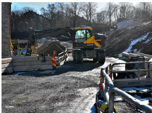
Figure 1 (Top) View of a construction site which represents a generic virtual use-case. (Bottom left) A simplified scheme showing possible interactions between autonomous systems/CPS, and humans at such a construction site. (Bottom right) Key properties of a CPS as defined in RELIANT.

Unique for the RELIANT research school is that all PhD-projects will be oriented around a common virtual use-case (Figure 1). The common use-case will ensure that the students (and the companies) all contribute to, and learn from, something larger than their individual project.