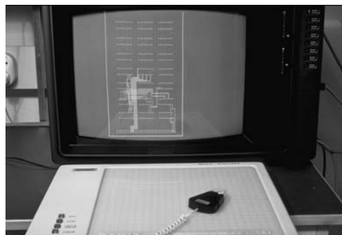
Figure 2. Håkan Lans' pointing device, the Houston Instrument HiPad, from the 1970s. Lans was able to create an interactive color graphics application by rebuilding a color TV into a color display reacting directly to the commands issued from the digitizer board (Håkan Lans, personal communication, 23 Jan. 2007).

A few years later, in 1981, Luxor launched the ABC 800 in an effort to appeal to a wider market for its computers. This machine supported a graphics mode with a 240 \times 240 -pixel resolution. The subsequent 1983 model, the ABC 806 (see Figure 6), featured high-resolution color graphics in conjunction with a color monitor (the ABC 812). This machine was equipped with a 128-Kbyte graphics memory that could store up to four different images separately, which made instant image swapping possible. However, part of the graphics memory could also be used for storing