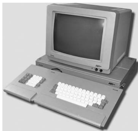
Figure 6. The Luxor ABC 806 computer.

The well-known UTOPIA project originated from several earlier, 1970s Scandinavian proj-