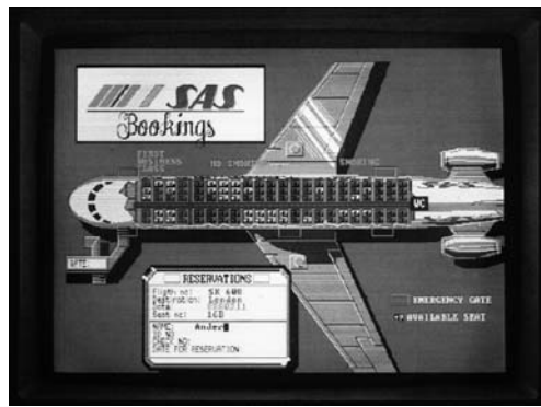
Figure 5. An airline reservation system based on EyesCream.

UTOPIA emphasized mutual learning between graphic workers (the users), computer scientists, and social researchers, and utilized