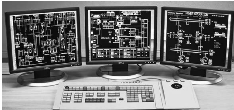
Figure 4. Representative Tessellator images emulated by TessEm software on a modern PC. Note the different symbol sizes. The images are displayed on flat screens in this photo because the product is available now only by emulation.