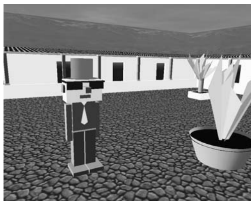
Figure 8. A screen shot from a DIVE application showing an avatar.

DIVE can be regarded as a multi-user virtual reality system based on a peer-to-peer approach using Internet protocol (IP) multicast communication, and it is because of its strong focus on flexibility, human-human commu-