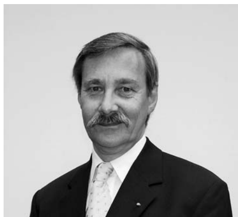
Figure 7. Håkan Lans, Swedish inventor of modern color graphics memory (c. 2002).

ects. These included, for example, Sweden's DEMOS project on trade unions, industrial democracy, and computers; and Denmark's DUE (Demokrati, Udvikling og EDB [Democracy, Development, and Electronic Data Processing]) project on democracy, education, and computer-based systems. 23