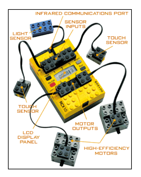
Figure 1. The Lego Mindstorms RCX unit

of Lego Mindstorms. The RCX is based on the single-chip H8/3292 [8], a RISC microcomputer running at 16 MHz. It features a H8/300 CPU core and a complement of on-chip supporting modules. The H8/3292 has 16 kBytes of read-only memory (ROM) and 512 bytes of on-chip random-access memory (RAM) and an additional 16 kBytes of external RAM in a separate circuit. The ROM includes several functions for reading of sensors, controlling the motors, display segments and numbers on a LCD-display. Located on-chip are one 16-bit timer, two 8-bit timers, a watchdog-timer, a serial communication interface and an 8-channel 10-bit analog-digital converter. The RCX also contains an IR-transceiver, useful for downloading programs and for communicating with other RCX units.